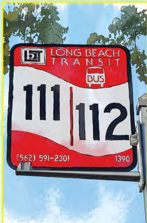
The 2024 Lakewood Transit Guide makes getting around the Southland quicker and easier.

Long Beach Transit operates nearly a dozen bus routes in Lakewood. Many of them connect to downtown Long Beach. Many routes also serve Lakewood Center or connect Lakewood to adjacent cities.