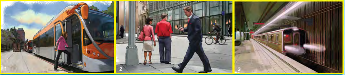
1. Metro offers both local and express routes. 2. Daily walking provides a wide range of health benefits. 3. Service is frequent and fast on Metro rail lines.