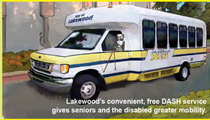
Lakewood's convenient, free DASH service gives seniors and the disabled greater mobility.

Pre-registration is required, and pickups are by reservation only. For registration information, call the DASH office at 562-924-0149.