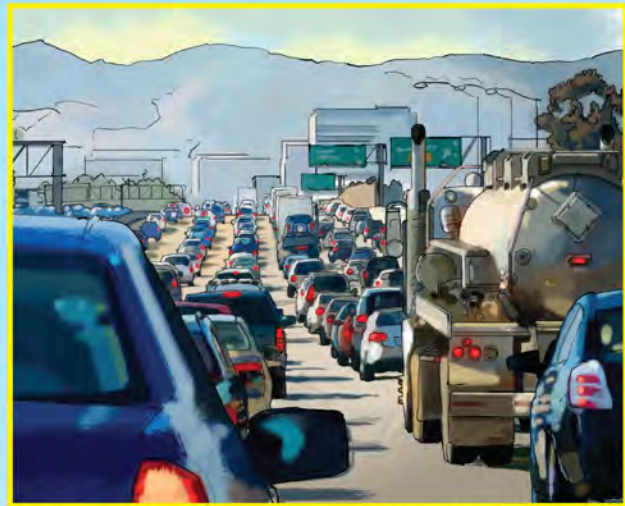
Gridlock isn't where anyone should be. Make your commute less stressful by taking the bus or train.